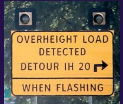
AC Low Overpass Detection