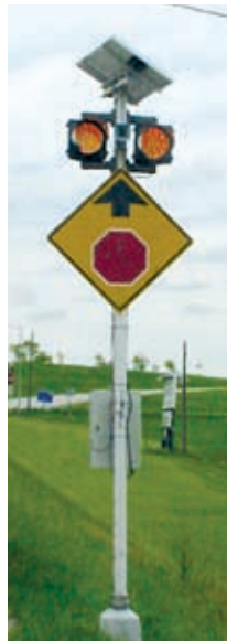
Advance Warning for Stop Ahead