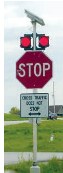
Stop Alert on Busy Highway

ELTEC's warning systems meet the Federal Highway Administrations' MUTCD (Manual on Uniform Traffic Control Devices) and ITE (Institute of Transportation Engineers) standards.