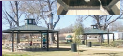
Park Gazebos with Spot Lights