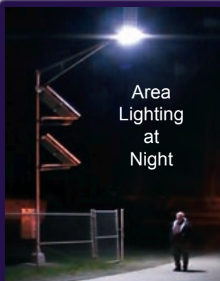
Area Lighting at Night