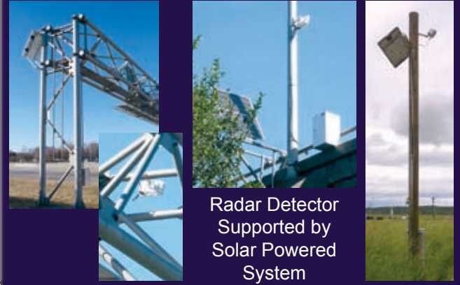
Radar Detector Supported by Solar Powered System