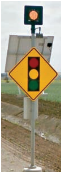
Warning System with Night Light