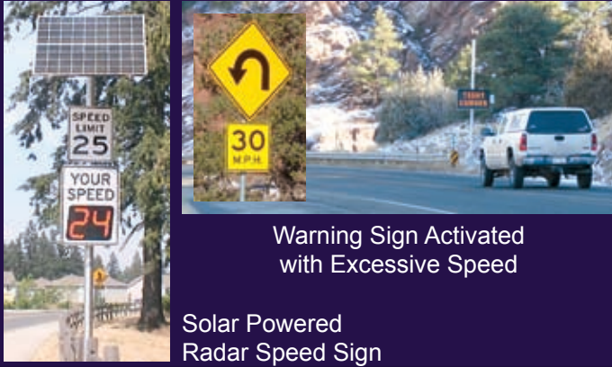
Warning Sign Activated with Excessive Speed