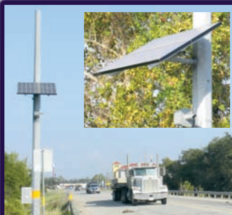
Solar Powered Over-Height Detection and Warning