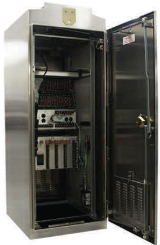
Eagle 332L Cabinet

Eagle Traffic Control Systems continues our 80+ year history of providing excellence in the ever evolving traffic industry. All of Eagle's products are developed with the highest standards of engineering and manufacturing. Eagle maintains a superior level of integrity in interactions with all of our business partners and customers. We also take tremendous pride in being model corporate citizens.